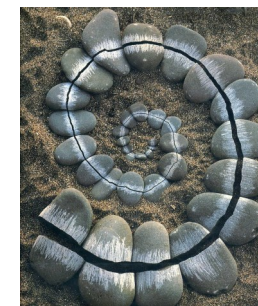
Cracked Rock Spiral