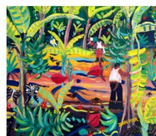
Jungle Banana's (Acrylic on canvas)

Banana cultivation takes place on the edge of the rainforest of Costa Rica. The towering banana plants catch the strong tropical light and create deep patches of shade. John chooses an off-white so the lightest tones appear in the painting.