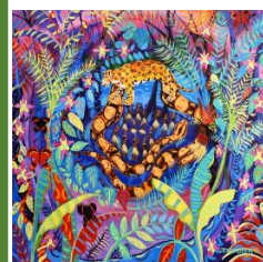
Spirits from the Amazon Rainforest (Ink)

Banana cultivation takes place on the edge of the rainforest of Costa Rica. The towering banana plants catch the strong tropical light and create deep patches of shade. John chooses an off-white so the lightest tones appear in the painting.