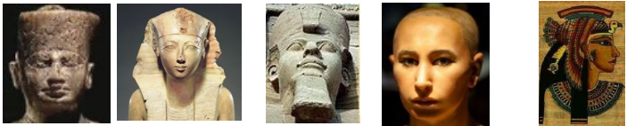
Khufu (2575–) Hatshepsut (1508–1458 BC) Ramesses II. (1303–) Tutankhamun (1341-1327) Cleopatra (69)

The Pharaohs of Ancient Egypt were the supreme leaders of the land.